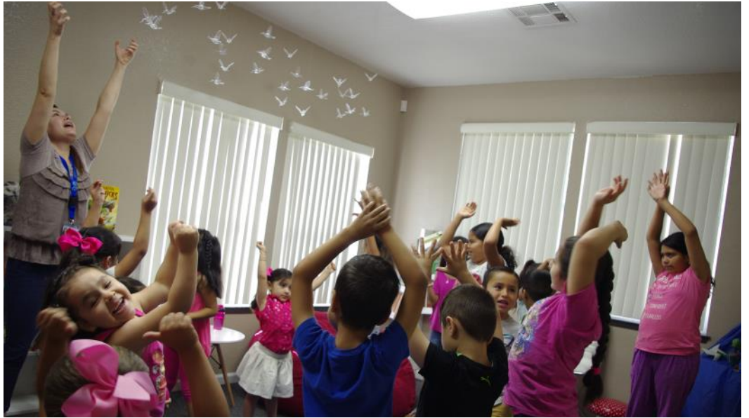
Top : On June 21, adult program participants learned about heathy food choices thanks to a visit from Kaweah Delta's Community Outreach program, then took part in a Zumba exercise class. Bottom : Children did fun movement and social-emotional skill building activities, made a craft, and ate a nutritious snack while their mothers took part in the adult summer program.