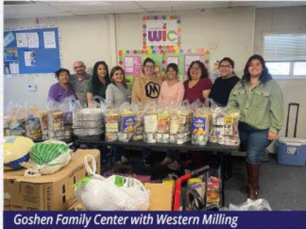
Goshen Family Center with Western Milling

In November, Western Milling partnered with us to distribute Thanksgiving meals including turkeys with all the fixings for families in need in the Goshen community.