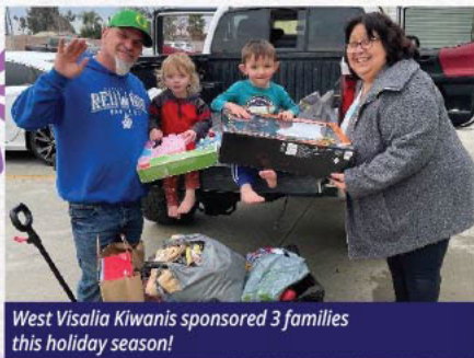
West Visalia Kiwanis sponsored 3 families this holiday season!