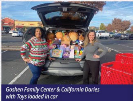
Goshen Family Center & California Dairies with Toys loaded in car

Between California Dairies and Salt & Light, we fed 83 families and 146 children.