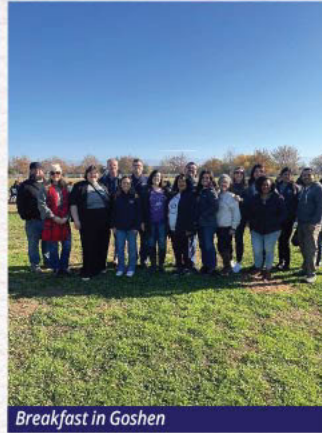
Breakfast in Goshen

A Christmas Miracle! California Dairies partnered with us and funded our our entire Christmas event by providing a toy for every child on our list. They even purchased blankets for every family attending.